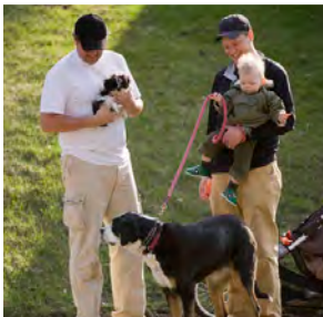
Clean up after "Fido" at home and in community