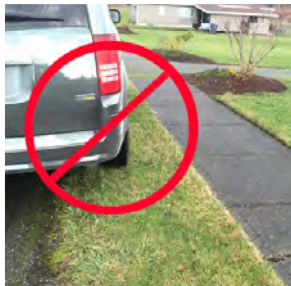
Be considerate of your neighbors: park right